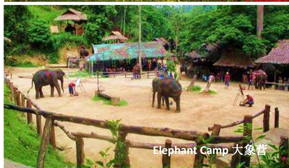
Elephant Camp 大象营