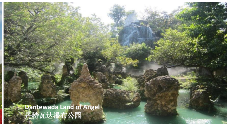
Dantewada Land of Angel 丹特瓦达瀑布公园