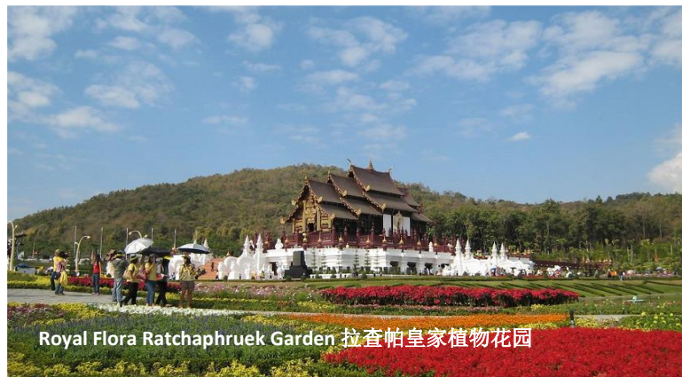
Royal Flora Ratchaphruek Garden 拉查帕皇家植物花园