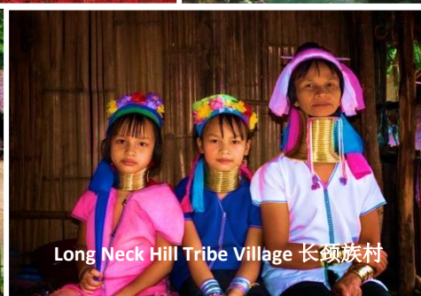
Long Neck Hill Tribe Village 长颈族村