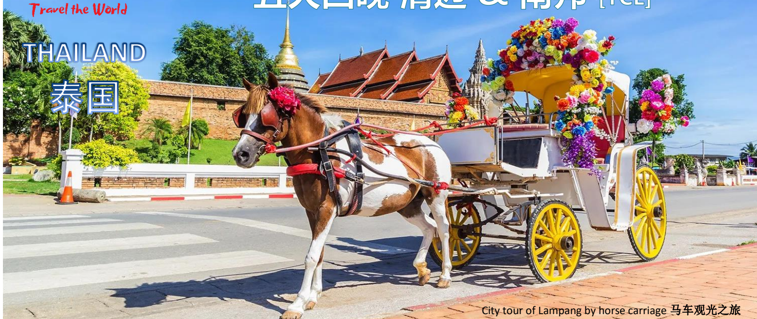
City tour of Lampang by horse carriage 马车观光之旅