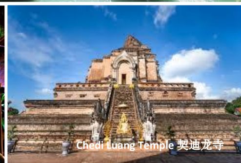
Chedi Luang Temple 契迪龙寺