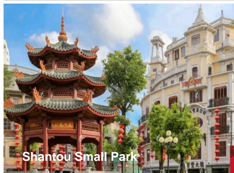
Shantou Small Park