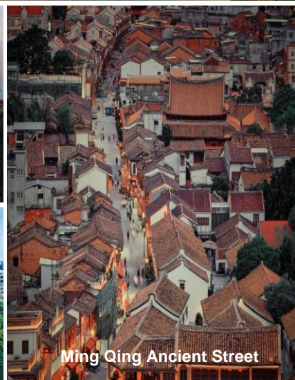
Ming Qing Ancient Street