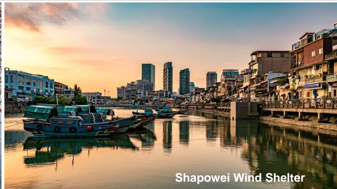
Shapowei Wind Shelter