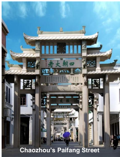
Chaozhou's Paifang Street