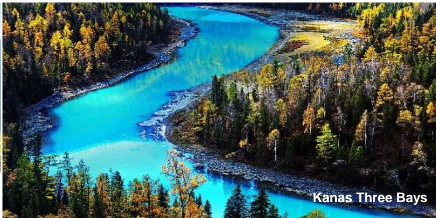
Kanas Three Bays