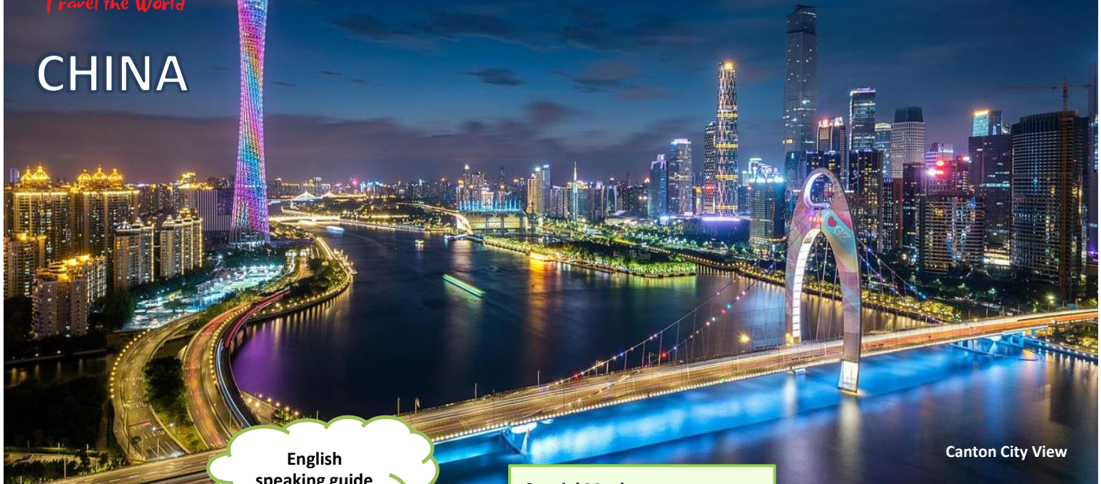
Canton City View

Guangzhou / Shenzhen / Zhuhai / Jiangmen / Zhongshan / Shunde / Foshan [CCAN]