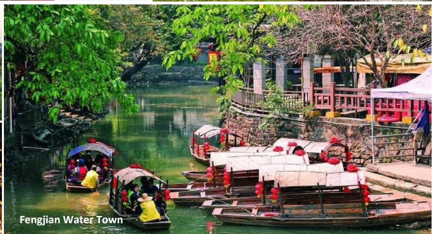
Fengjian Water Town