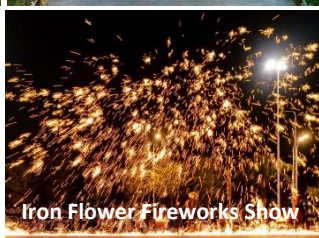
Iron Flower Fireworks Show