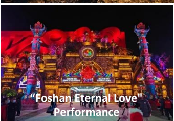
"Foshan Eternal Love" Performance