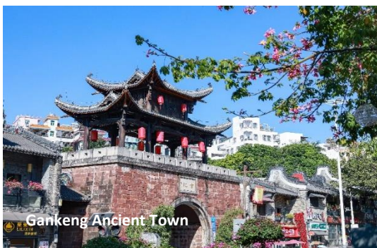
Gankeng Ancient Town