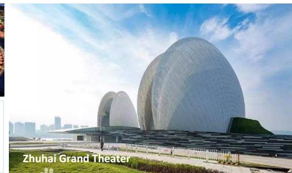
Zhuhai Grand Theater