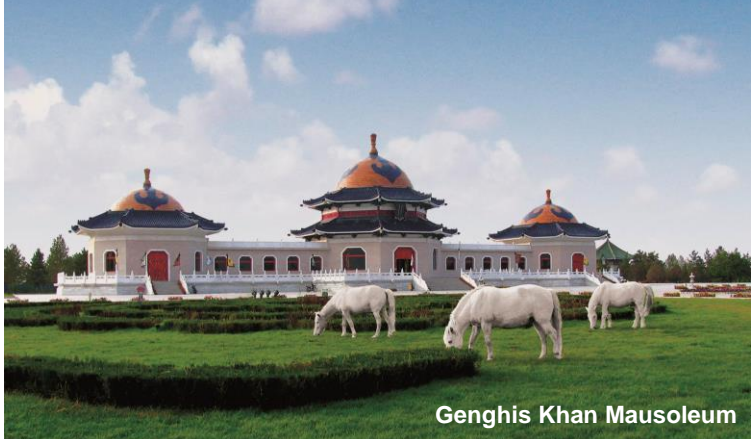
Genghis Khan Mausoleum