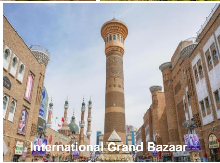
International Grand Bazaar