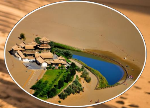
Mingsha Mountain Crescent Spring