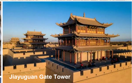
Jiayuguan Gate Tower