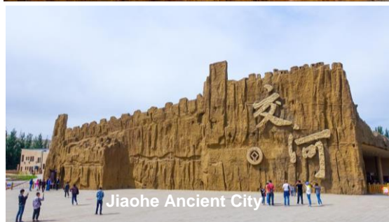
Jiaohu Ancient City