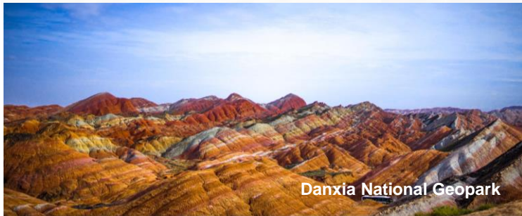
Danxia National Geopark