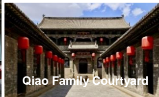
Qiao Family Courtyard