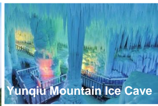
Yunqiu Mountain Ice Cave