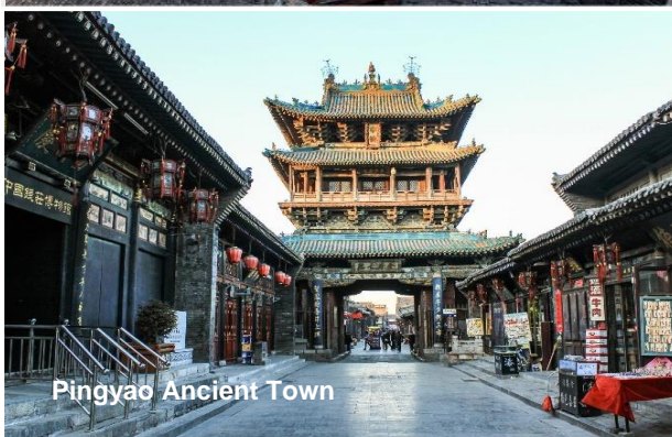
Pingyao Ancient Town