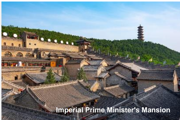
Imperial Prime Minister's Mansion