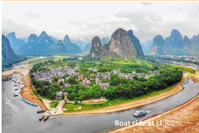
Boat ride at Li River