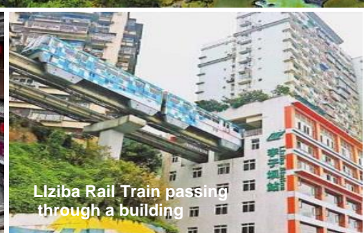
Liziba Rail Train passing through a building