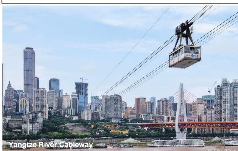
Yangtze River Cableway