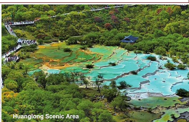
Huanglong Scenic Area