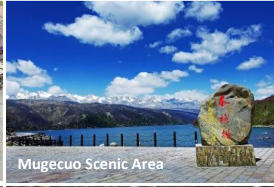
Mugecuo Scenic Area