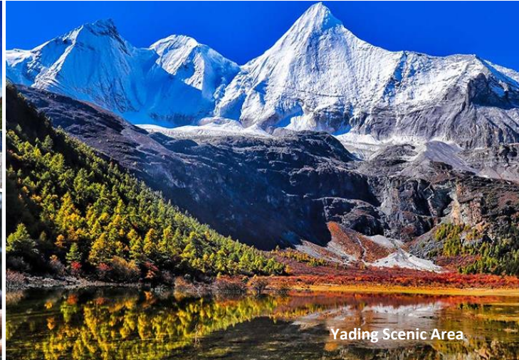
Yading Scenic Area