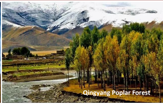
Qingyang Poplar Forest