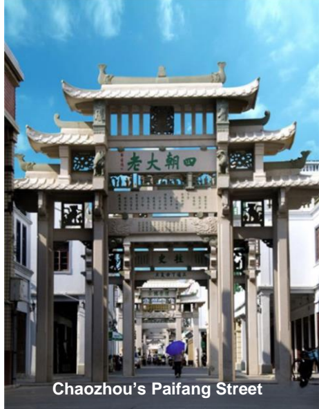
Chaozhou's Paifang Street