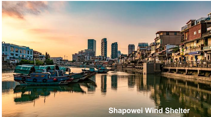
Shapowei Wind Shelter