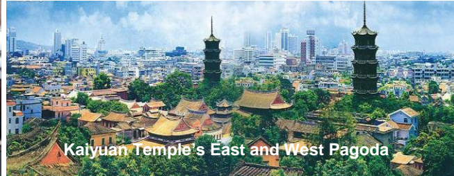
Kaiyuan Temple's East and West Pagoda