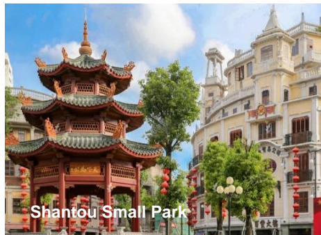
Shantou Small Park