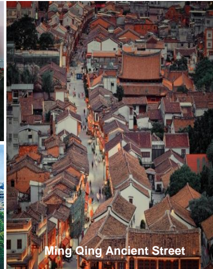
Ming Qing Ancient Street