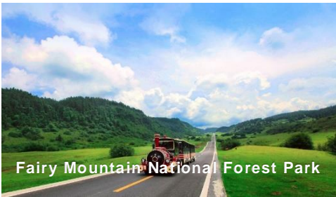
Fairy Mountain National Forest Park