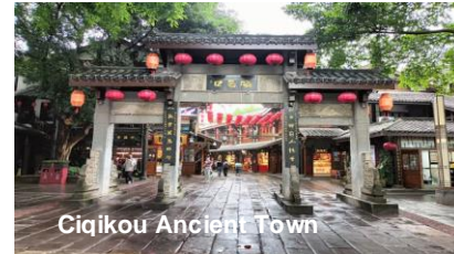
Ciqikou Ancient Town