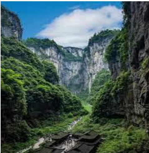
Tiankeng Three Bridges Scenic Area