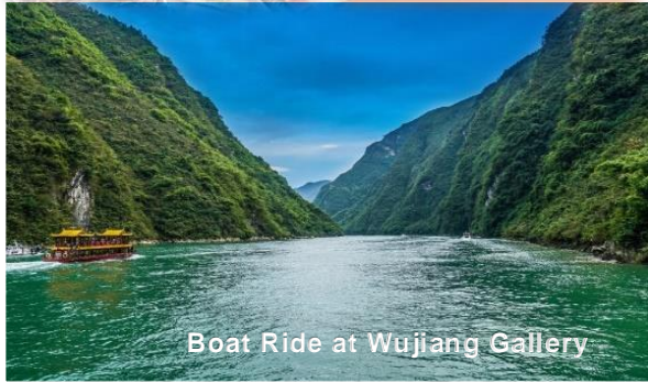
Boat Ride at Wujiang Gallery