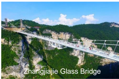
Zhangjiajie Glass Bridge