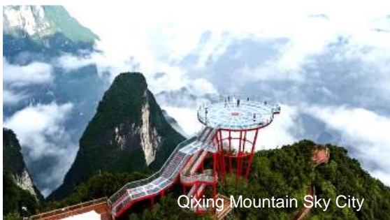
Qixing Mountain Sky City