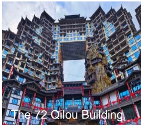
The 72 Qilou Building