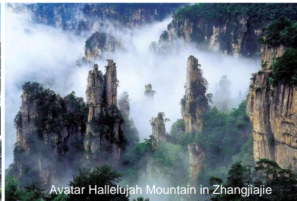
Avatar Hallelujah Mountain in Zhangjiajie