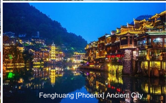
Fenghuang [Phoenix] Ancient City