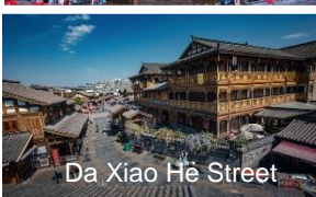
Da Xiao He Street