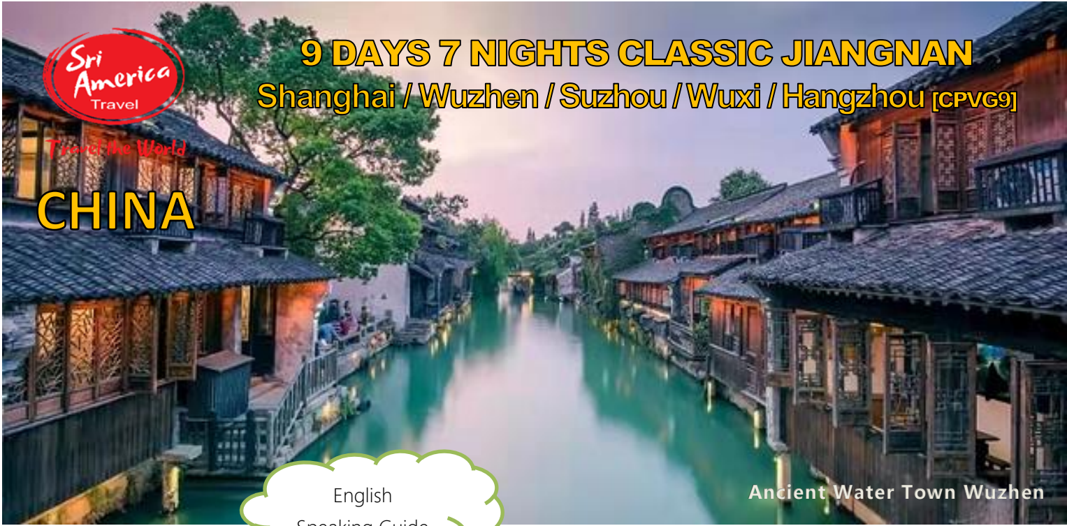
Ancient Water Town Wuzhen