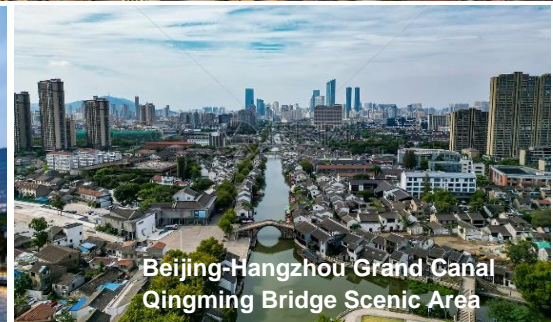
Beijing-Hangzhou Grand Canal Qingming Bridge Scenic Area