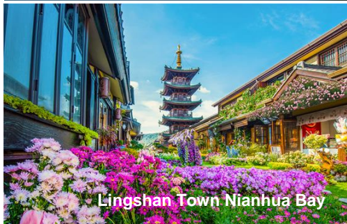
Lingshan Town Nianhua Bay