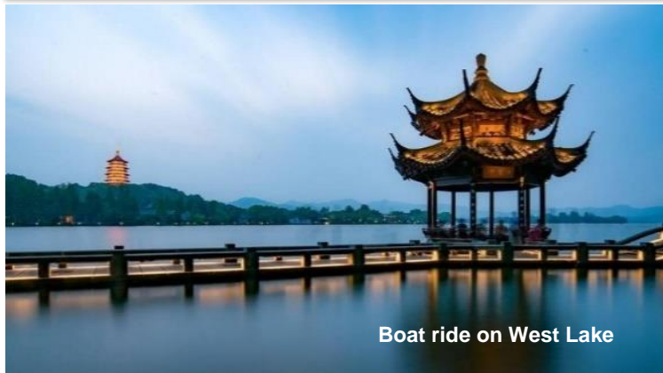
Boat ride on West Lake