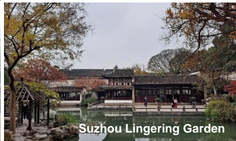
Suzhou Lingering Garden