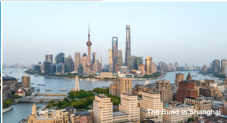
The Bund in Shanghai