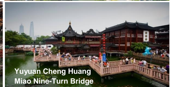
Yuyuan Cheng Huang Miao Nine-Turn Bridge