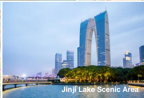
Jinji Lake Scenic Area