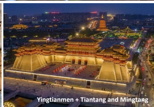
Yingtianmen + Tiantang and Mingtang