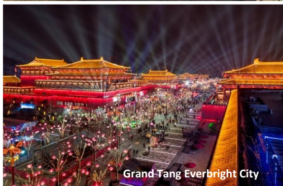
Grand Tang Everbright City