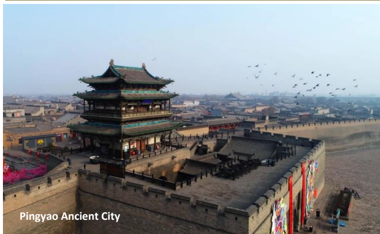
Pingyao Ancient City