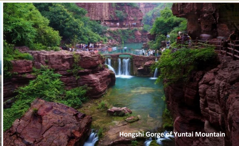
Hongshi Gorge of Yuntai Mountain