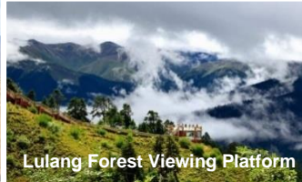
Lulang Forest Viewing Platform