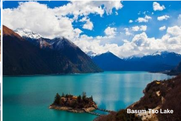
Basum Tso Lake