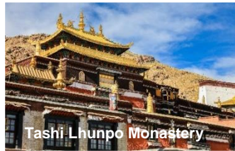
Tashi Lhunpo Monastery