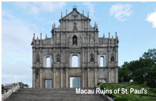
Macau Ruins of St. Paul's