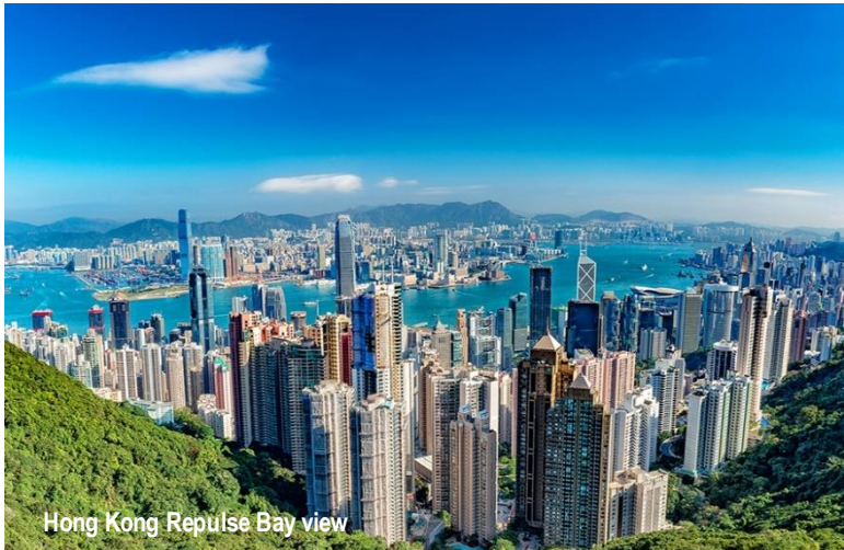
Hong Kong Repulse Bay view