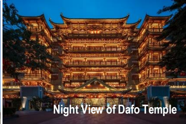
Night View of Dafo Temple