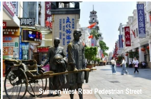
Sunwen West Road Pedestrian Street