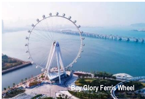
Bay Glory Ferris Wheel