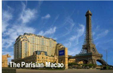
The Parisian Macao