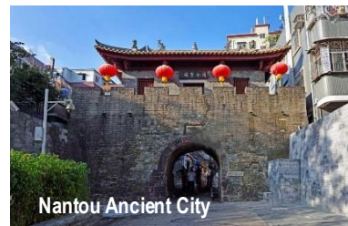
Nantou Ancient City