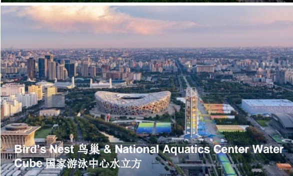
Bird's Nest 鸟巢 & National Aquatics Center Water Cube 国家游泳中心水立方