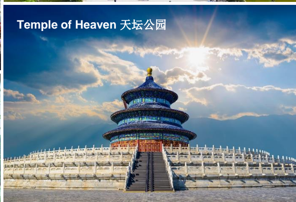
Temple of Heaven 天坛公园