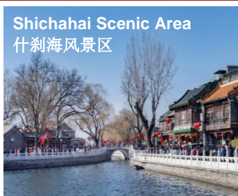
Shichahai Scenic Area 什刹海风景区