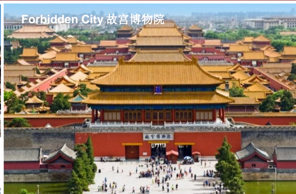
Forbidden City 故宫博物院