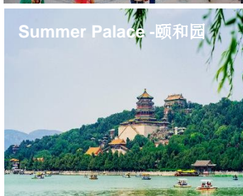
Summer Palace - 颐和园