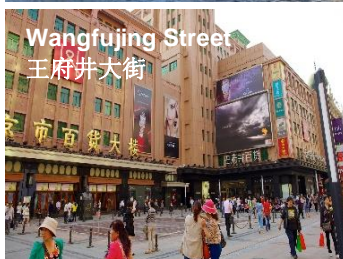
Wangfujing Street 王府井大街