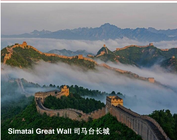
Simatai Great Wall 司马台长城