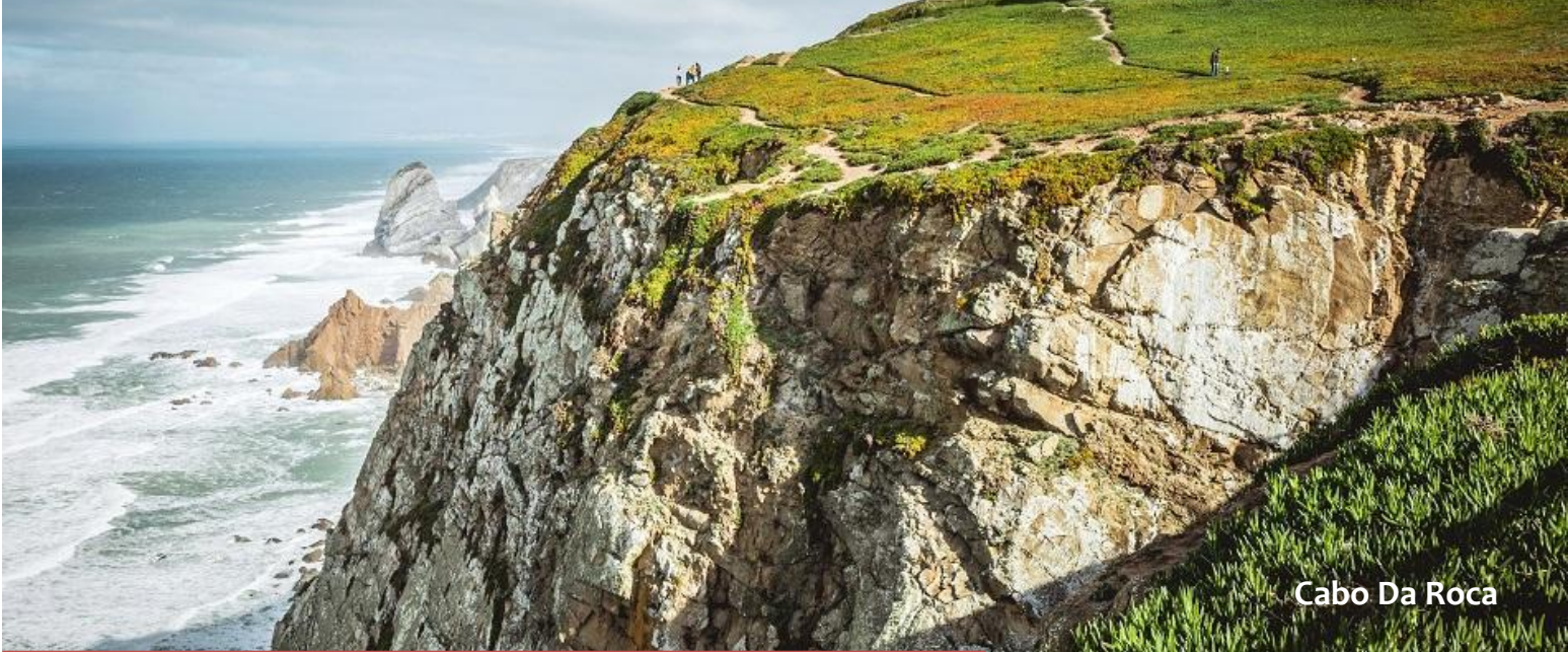
Cabo Da Roca