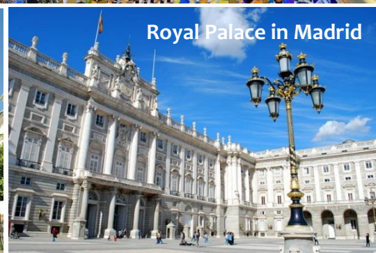
Royal Palace in Madrid