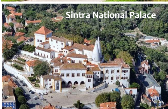
Sintra National Palace