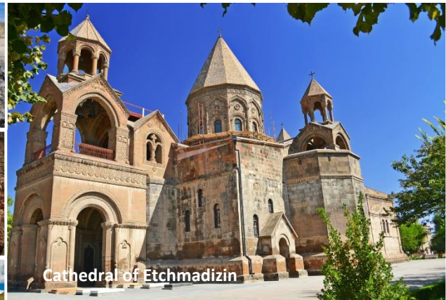
Cathedral of Etchmadszin