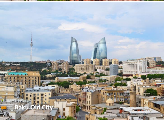
Baku Old City