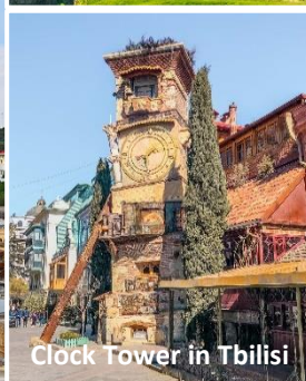
Clock Tower in Tbilisi