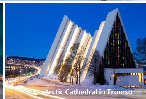
Arctic Cathedral in Tromsø