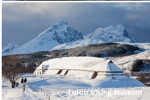
Lofotr Viking Museum