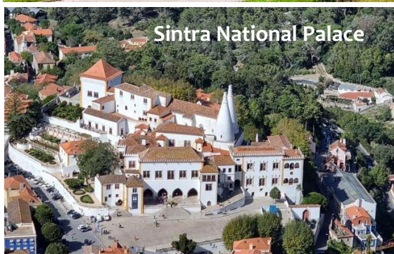
Sintra National Palace