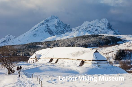
Lofotr Viking Museum