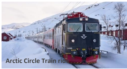
Arctic Circle Train ride