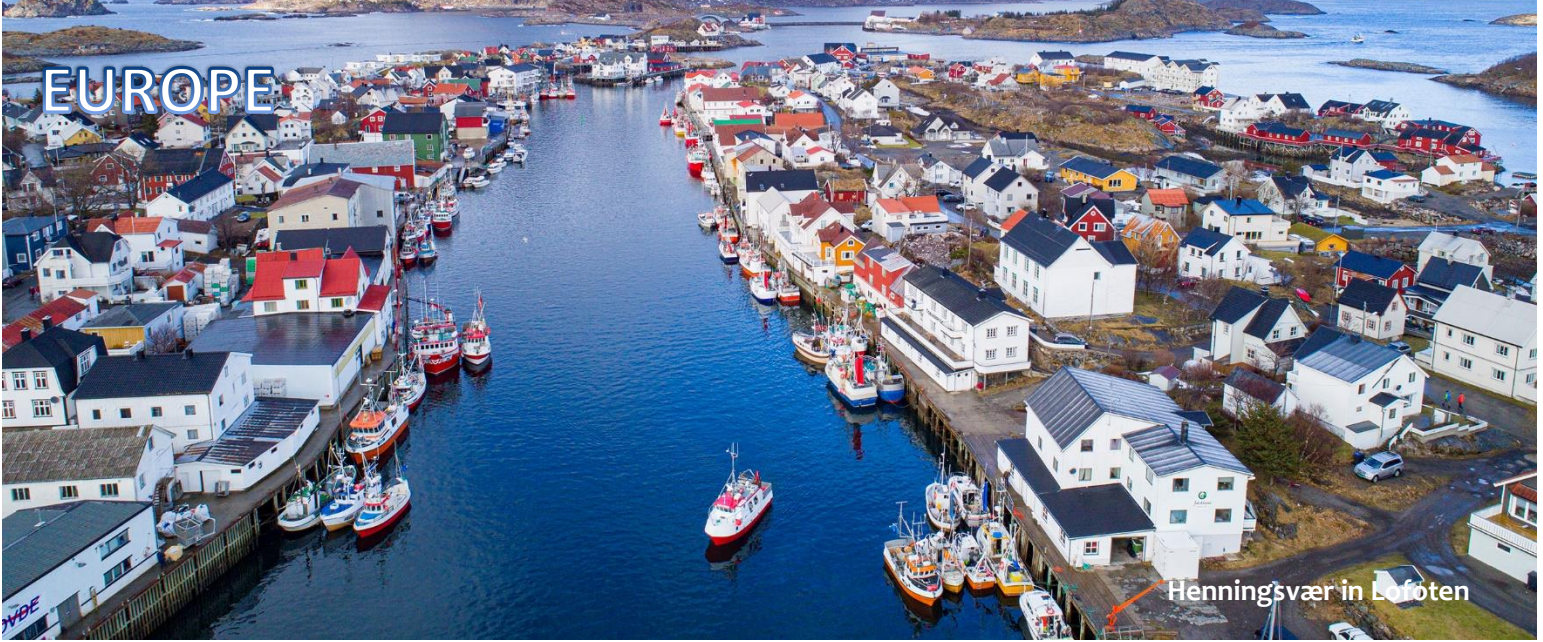
Henningsvær in Lofoten