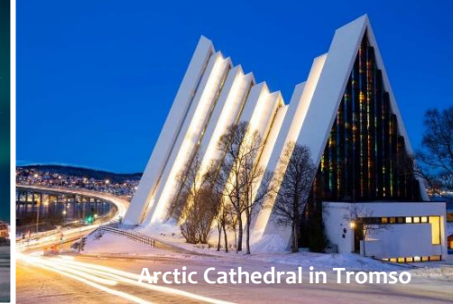
Arctic Cathedral in Tromsø