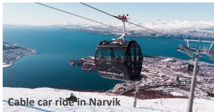
Cable car ride in Narvik