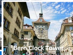
Bern Clock Tower