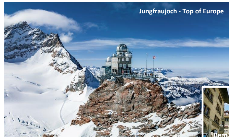
Jungfrauoch - Top of Europe