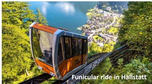
Funicular ride in Hallstatt