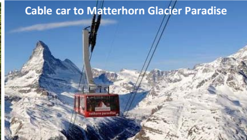
Cable car to Matterhorn Glacier Paradise