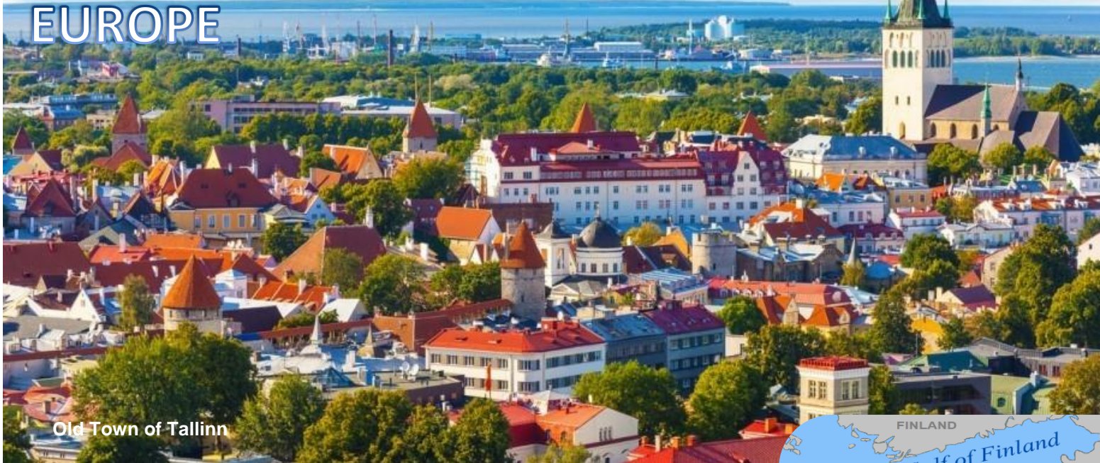
Old Town of Tallinn