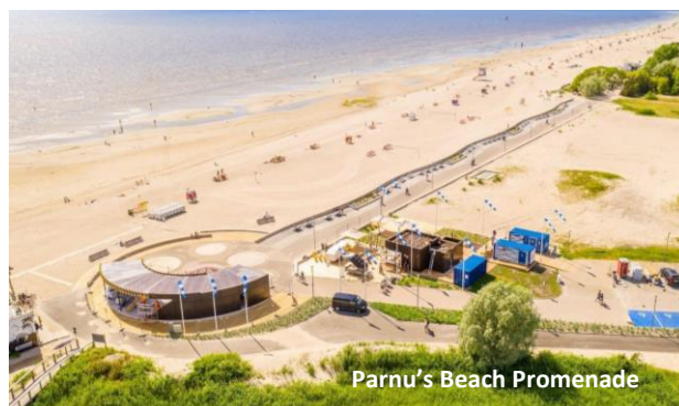
Parnu's Beach Promenade