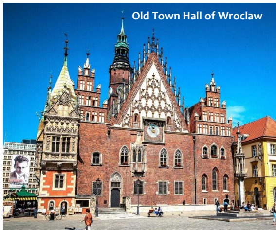
Old Town Hall of Wrocław