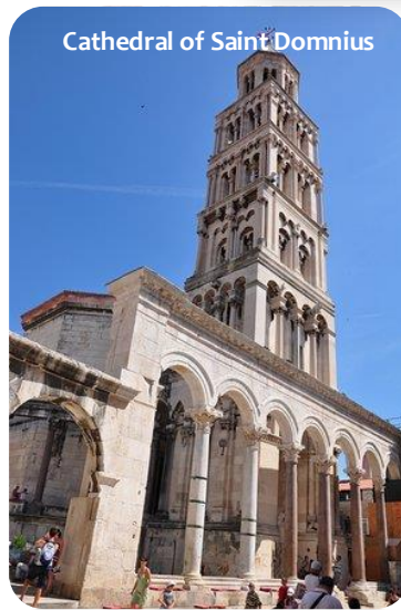
Cathedral of Saint Domnius