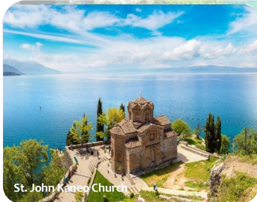
St. John Kaneo Church