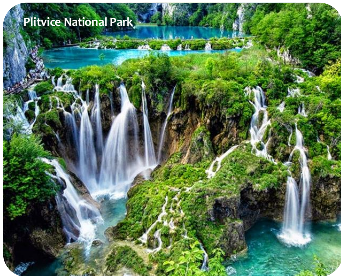
Plitvice National Park