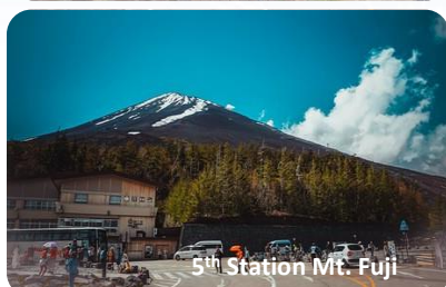
5 th Station Mt. Fuji