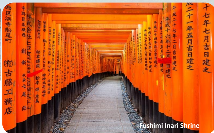
Fushimi Inari Shrine