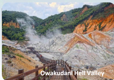
Owakudani Hell Valley