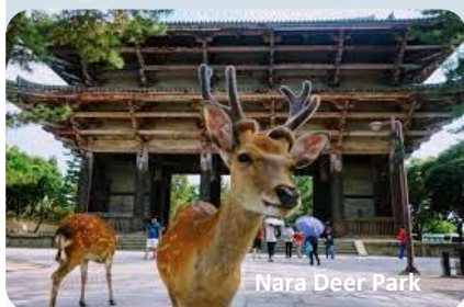
Nara Deer Park