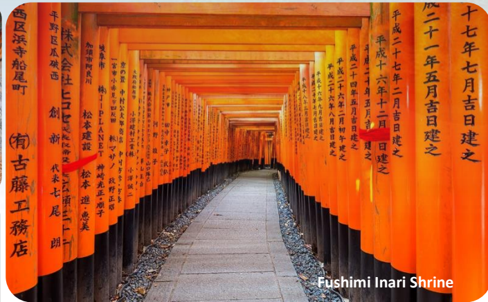
Fushimi Inari Shrine