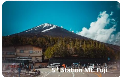
5 th Station Mt. Fuji