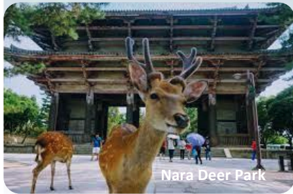
Nara Deer Park