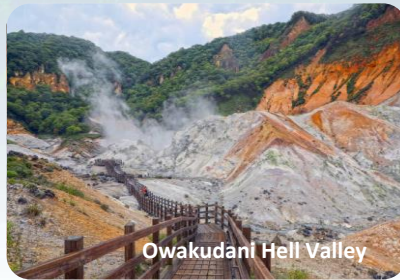
Owakudani Hell Valley