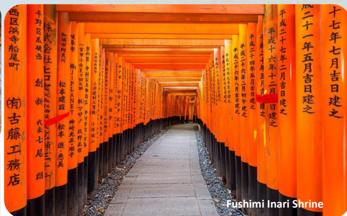
Fushimi Inari Shrine