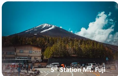
5 th Station Mt. Fuji