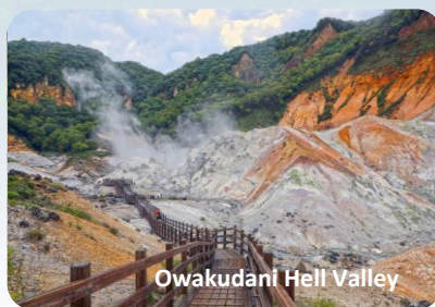
Owakudani Hell Valley