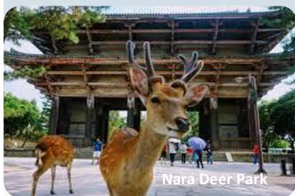
Nara Deer Park