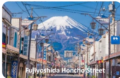
Fujiyoshida Honcho Street