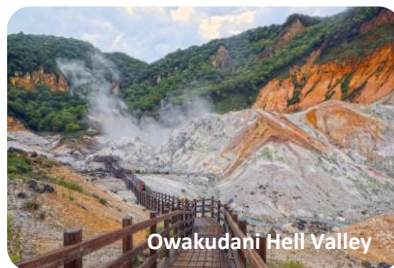
Owakudani Hell Valley