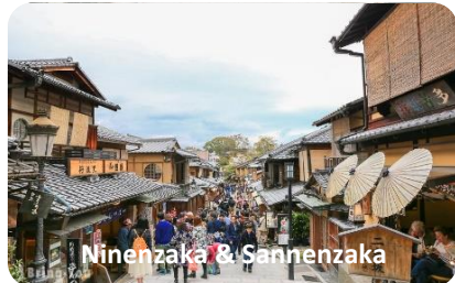
Ninenzaka & Sannenzaka