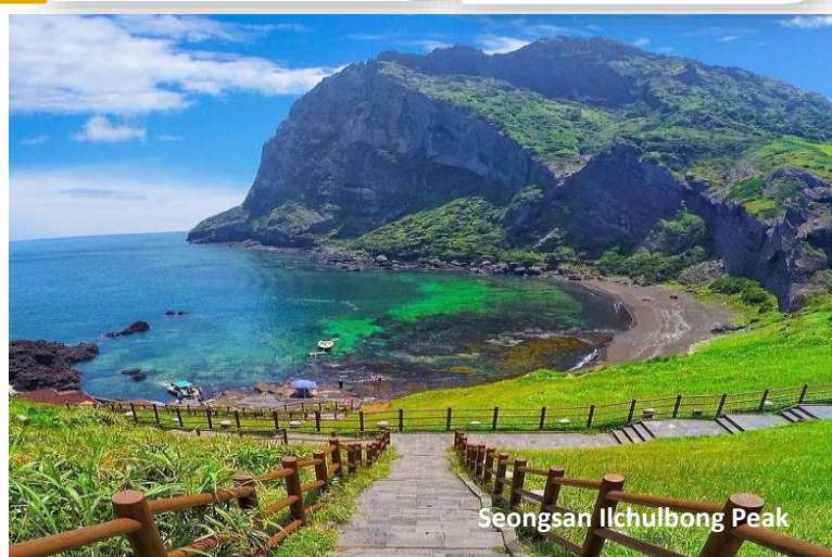
Seongsan Ilchulbong Peak