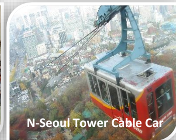
N-Seoul Tower Cable Car