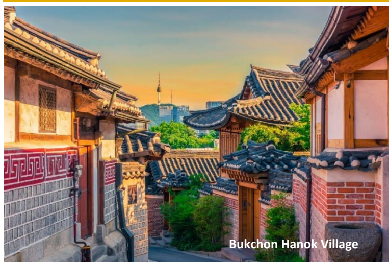
Bukchon Hanok Village