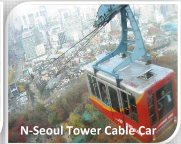
N-Seoul Tower Cable Car