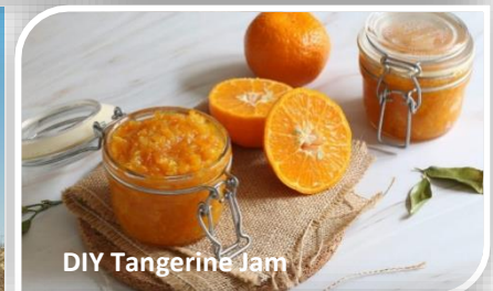
DIY Tangerine Jam