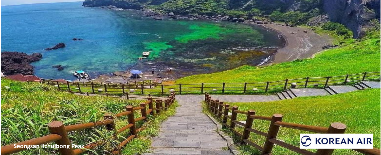
Seongsan Ilchulbong Peak