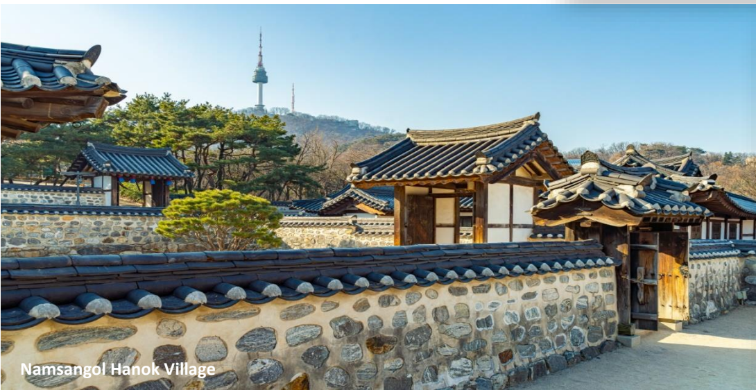
Namsangol Hanok Village