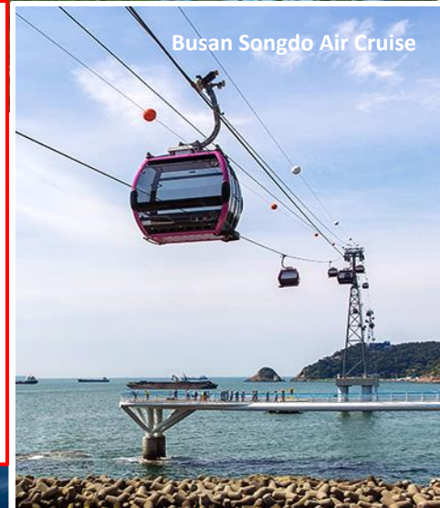
Busan Songdo Air Cruise