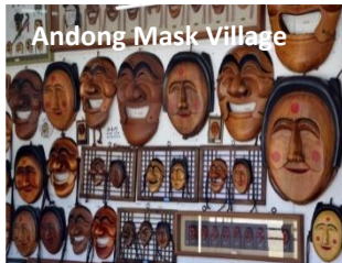
Andong Mask Village