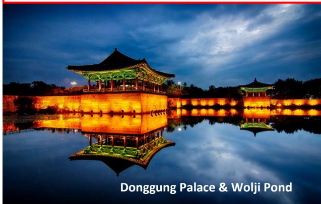
Donggung Palace & Wolji Pond