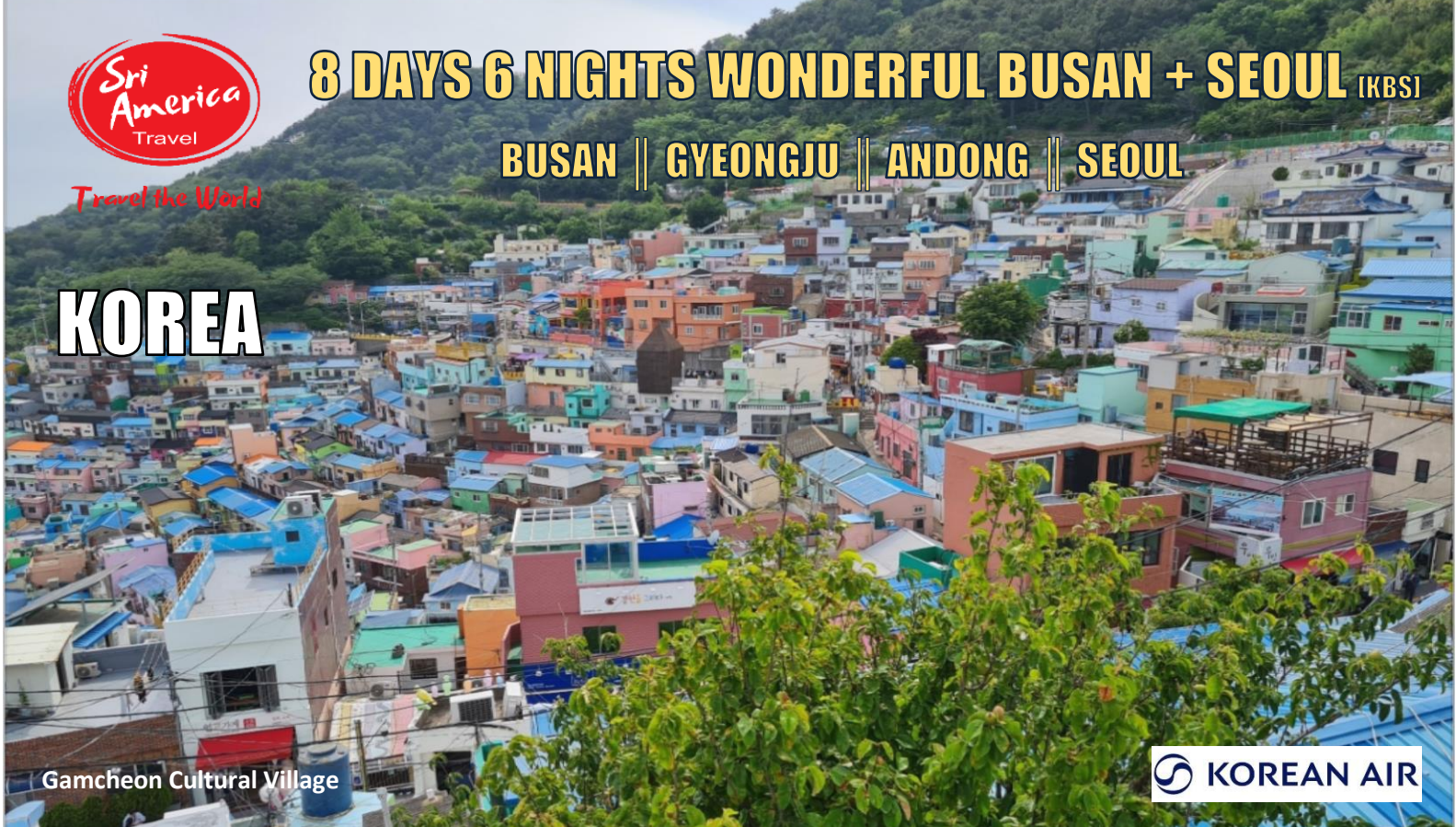
Gamcheon Cultural Village