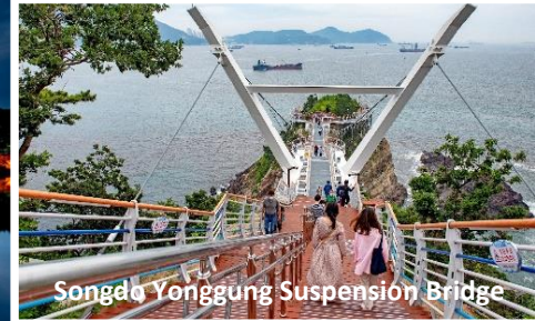
Songdo Yonggung Suspension Bridge