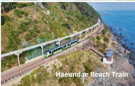
Haeundae Beach Train