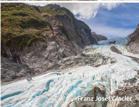
Franz Josef Glacier