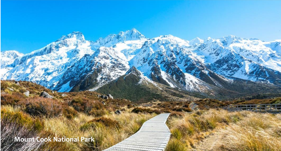
Mount Cook National Park