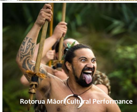
Rotorua Māori Cultural Performance