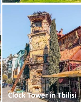
Clock Tower in Tbilisi