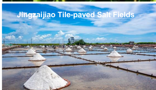
Jingzaijiao Tile-paved Salt Fields