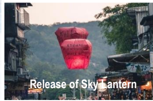
Release of Sky Lantern