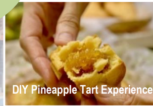
DIY Pineapple Tart Experience