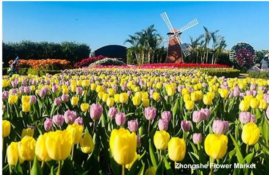
Zhongshe Flower Market