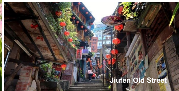
Jiufen Old Street