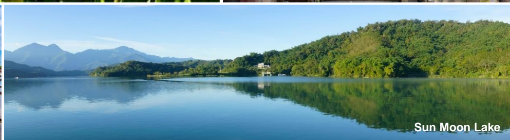
Sun Moon Lake