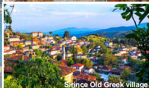
Sirince Old Greek village