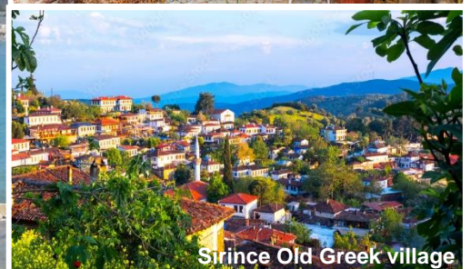
Sirince Old Greek village